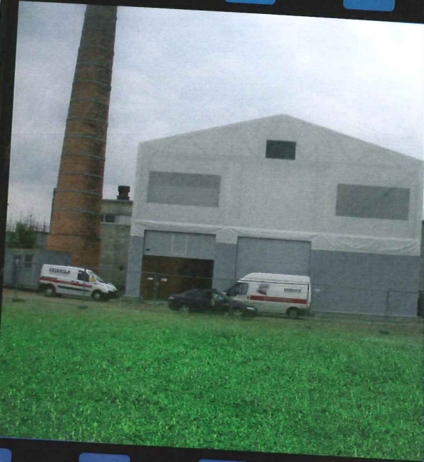
PVC hangar application areas